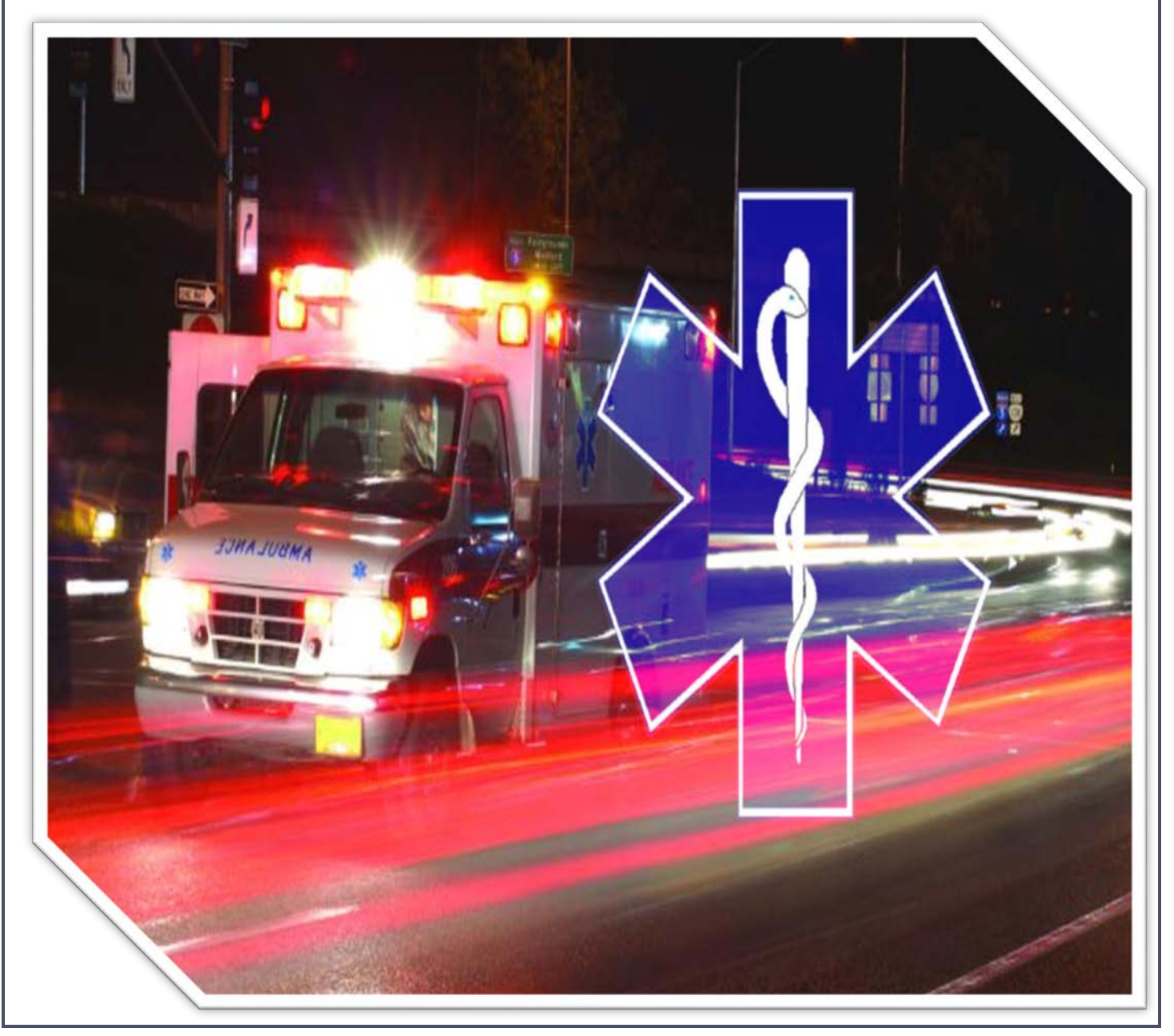
West Virginia Office of Emergency Medical Services Certification Policies